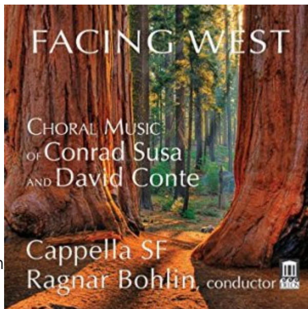
Cappella SF: "Facing West"

In June 2010 he made his Carnegie Hall debut conducting Brahms' Ein deutsches Requiem. Since 2011 he has appeared several times as guest conductor of the São Paulo Symphony Orchestra and Chorus.